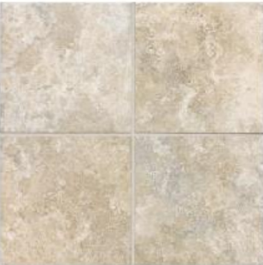
kitchen + bathroom tile