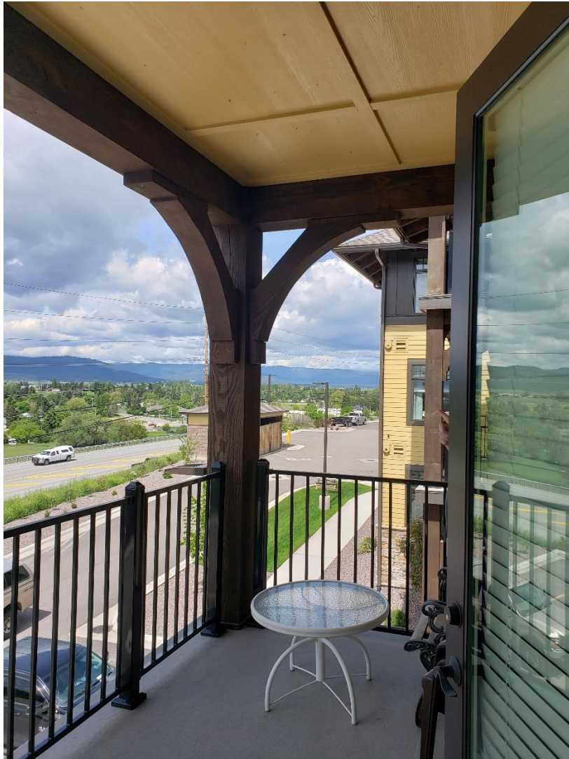
Overlooks West Valley