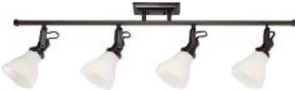
kitchen track light fixture