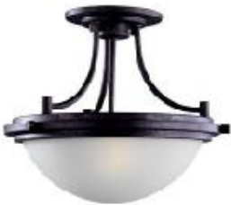
entry ceiling light fixture