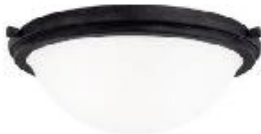
living ceiling light fixture